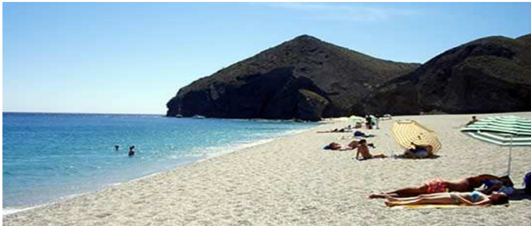
The Beaches of Almeria are 2 km from these apartments

Clients are urged to move fast on these properties as the value here is not to be repeated.