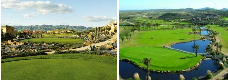
Desert Springs and Valle Del Este Golf courses nearby

Clients are urged to move fast on these properties as the value here is not to be repeated.